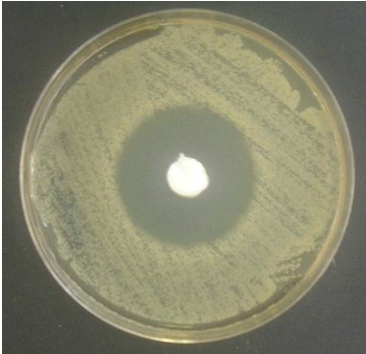
Methicillin resistant Staphylococcus aureus with allixin cream added (Allimax cream) showing a large zone of inhibition