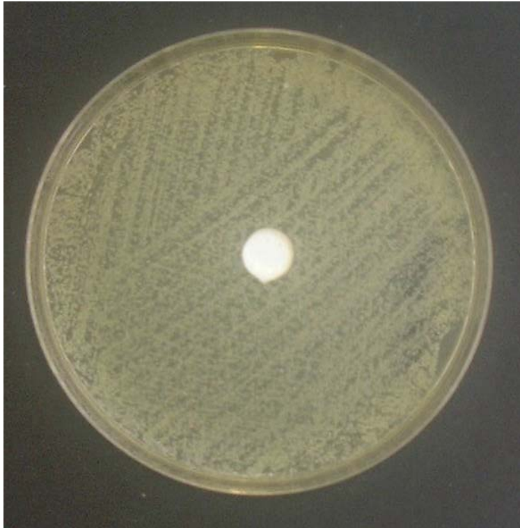
Methicillin resistant Staphylococcus aureus with plain aqueous cream

Most recently the University of East London have shown that aqueous extracts of allicin when formulated into a simple cream are able to kill vast swathes of the so called “superbug” MRSA (methicillin resistant Staphylococcus aureus ). This nasty bacterium is forever changing its structure and developing resistance to many pharmaceutical antibiotics. This may have a significant effect on people who suffer from skin diseases such as eczema and acne as this bacterium is 6 to 7 times more likely to colonise these patients.